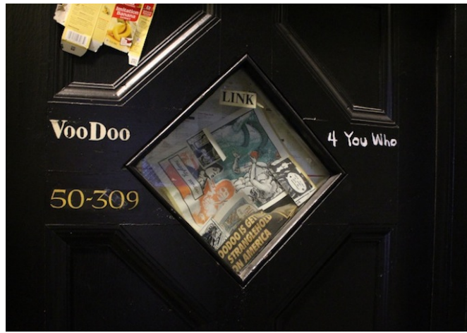
Voo Doo door on the third floor of Walker - Reunion Week 2013.